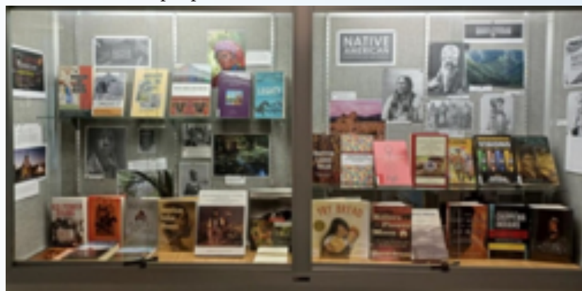
The Native American Heritage Month display inside the LMC library lobby features Native American literature.

At their November 10, 2021, meeting, the Governing Board unanimously approved a resolution in support of Native American Heritage Month. Commonly recognized as American Indian and Alaska Native Heritage Month, it takes place in November and is a time to acknowledge and celebrate the rich and diverse traditions, cultures, and histories of Native people.